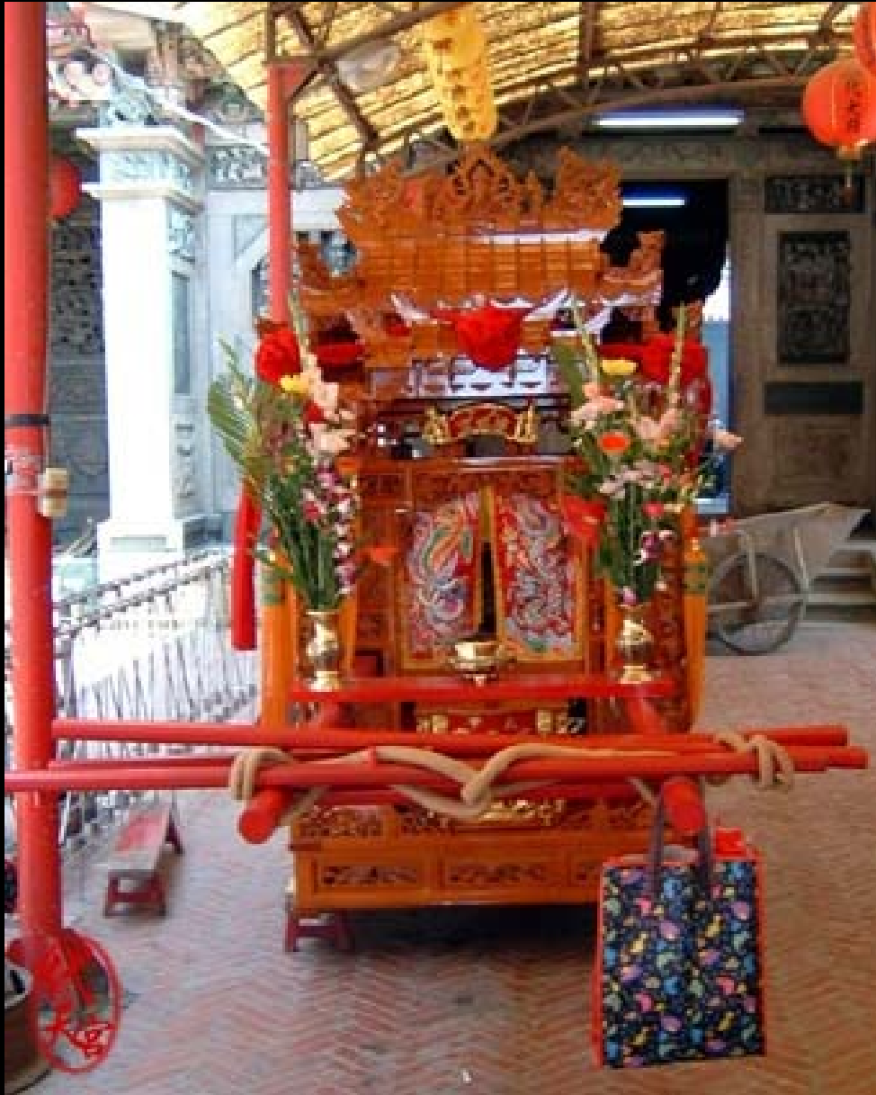
(sedan carried by 8 people)